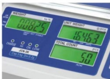
Green LED Backlight