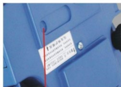
Transport protection device