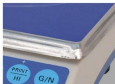
ABS Housing with Stainless steel pan